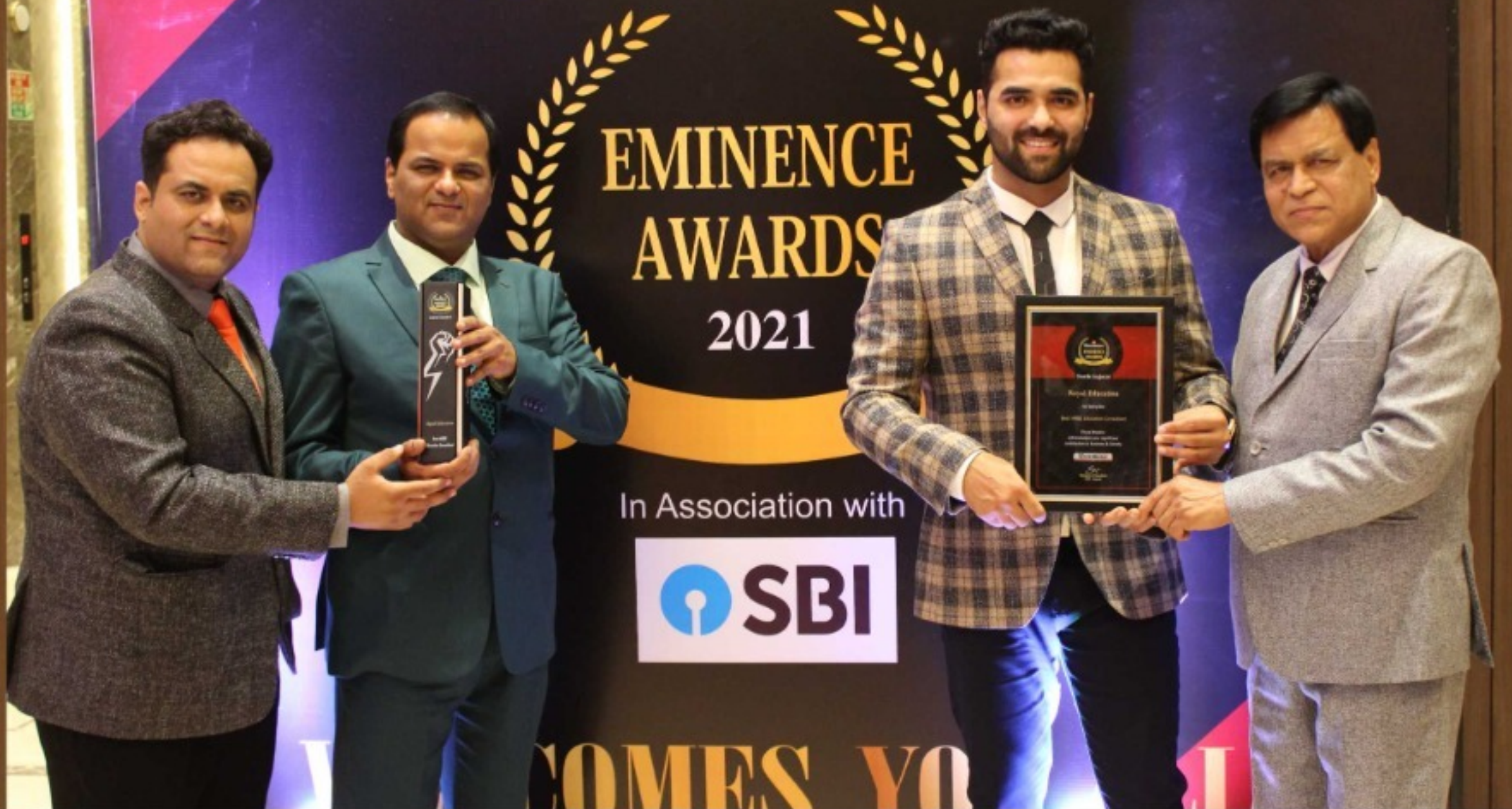
EMINENCE Award given by Deputy Chief Minister of Gujarat Mr. Nitinbhai Patel as the "MOST TRUSTED MEDICAL ADMISSION CONSULTANCY"